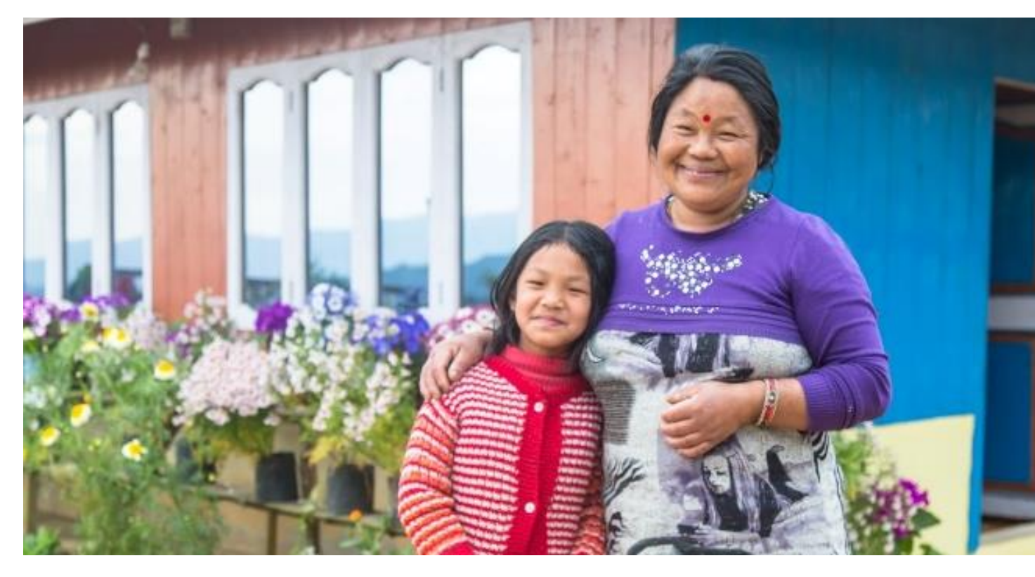
Shree Antu Community Homestay: Hope and Path to Recovery

While Nepal was covered in uncertainties during the peak of the second wave of the pandemic in early 2021, the Shree Antu Community Homestay at Ilam had been working to build back better. The stories from the tourism-dependent communities on upgrading their infrastructure and their enthusiasm to maintain the health, hygiene and sanitation for the travelers and their communities has been one motivating story to share. Thinking about the times where travelers visited and loved their communities, the hosts felt the pandemic would end at one point and travelers would visit their beloved communities once again. With this hope, the hosts at Shree Antu Community Homestay, Ilam took personal loans from cooperatives and financial institutions to upgrade their infrastructure to provide the guests with a comfortable authentic experience. The hope of revival and investment shows their resilience and, in their own words, are very proud of how their culture of consumption has gradually shifted towards reinvesting.